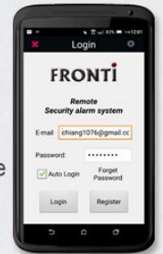
User Phone APP

Console via GSM/Wi-Fi connect to app Console send event to user phone app Console call to user phone to play voice APP via GSM/Wi-Fi to setting the console APP can read event log from the console APP can set/read all program data on console