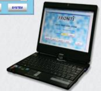
Web Server Center

Center via SMS/IP to setting the console Console send alarm event to the center Console call to the center to play voice Center can read event from console IP Module send E-mail to report event