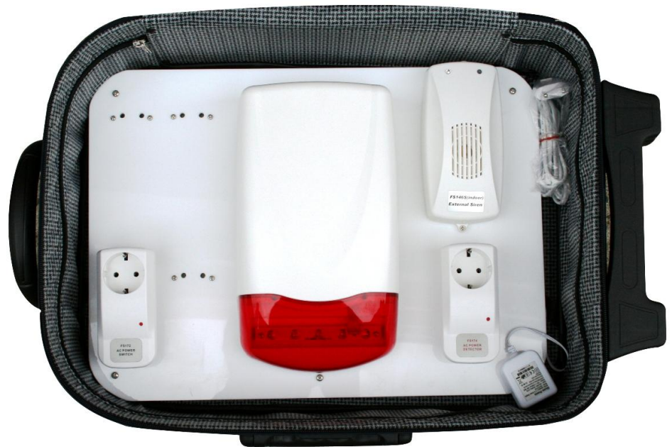
The suitcase for package the a Console and a siren