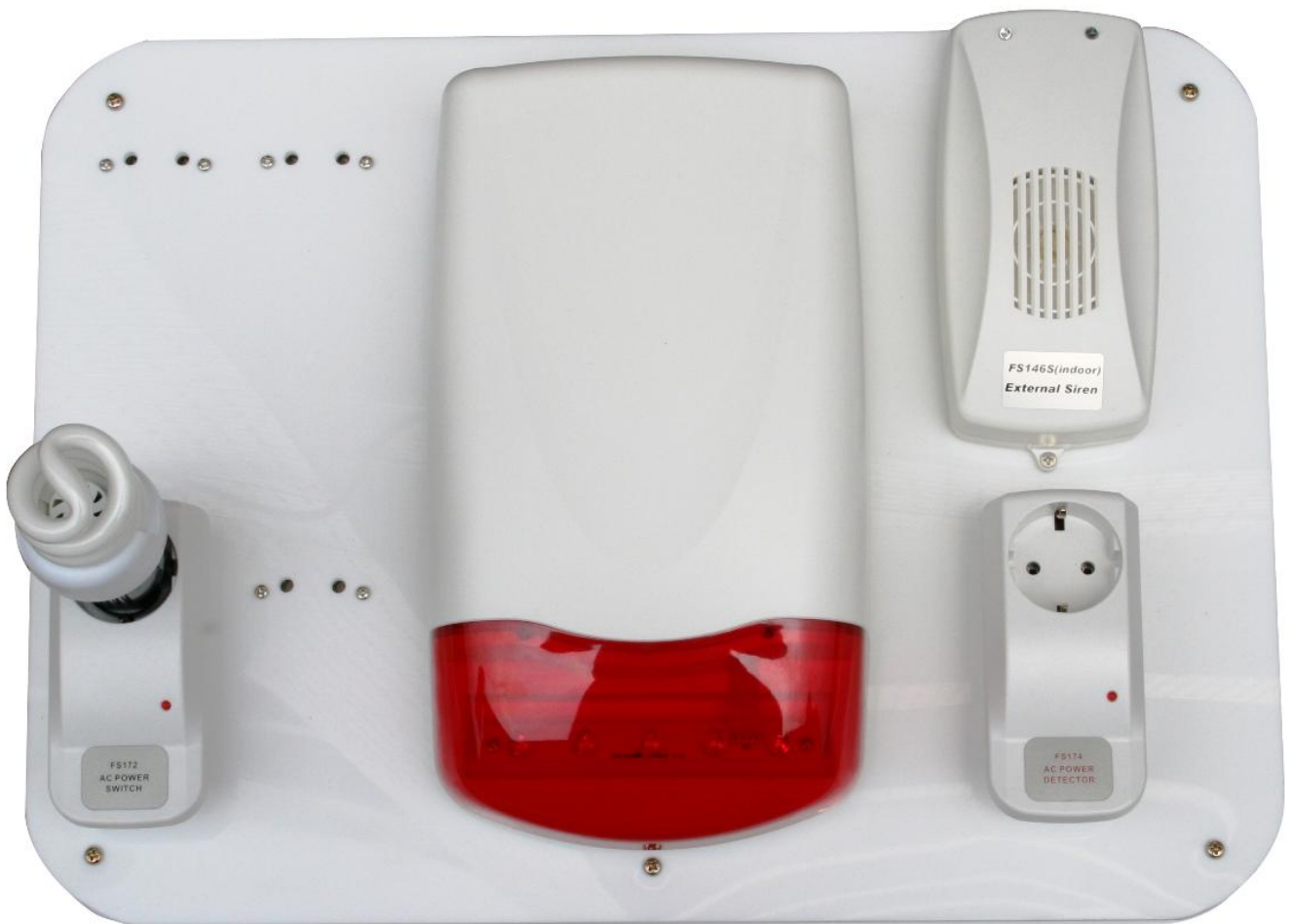
The siren, AC power switch and AC power detector Demo kit