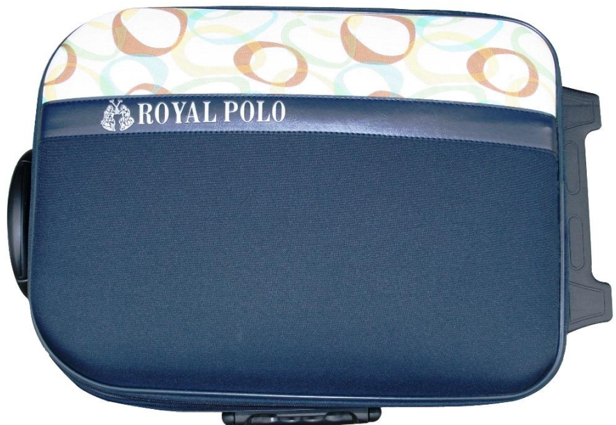
The suitcase size L 50cm X W 35cm X H 16cm