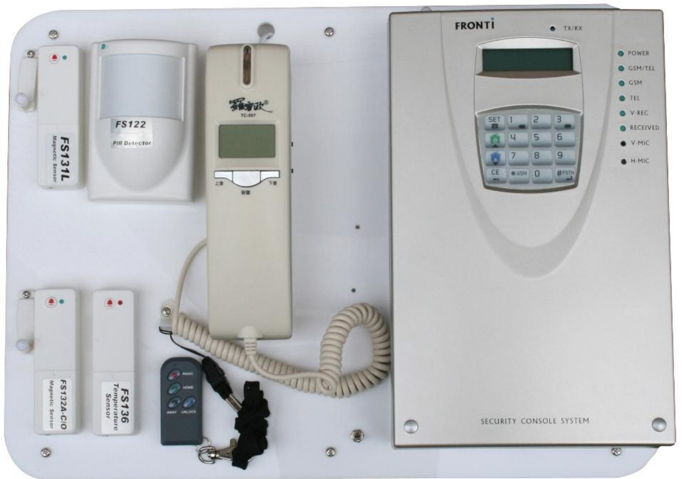
The FS290 Console, phone set, Sensor Demo kit